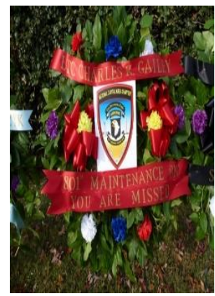
Veterans Day in Washington, DC